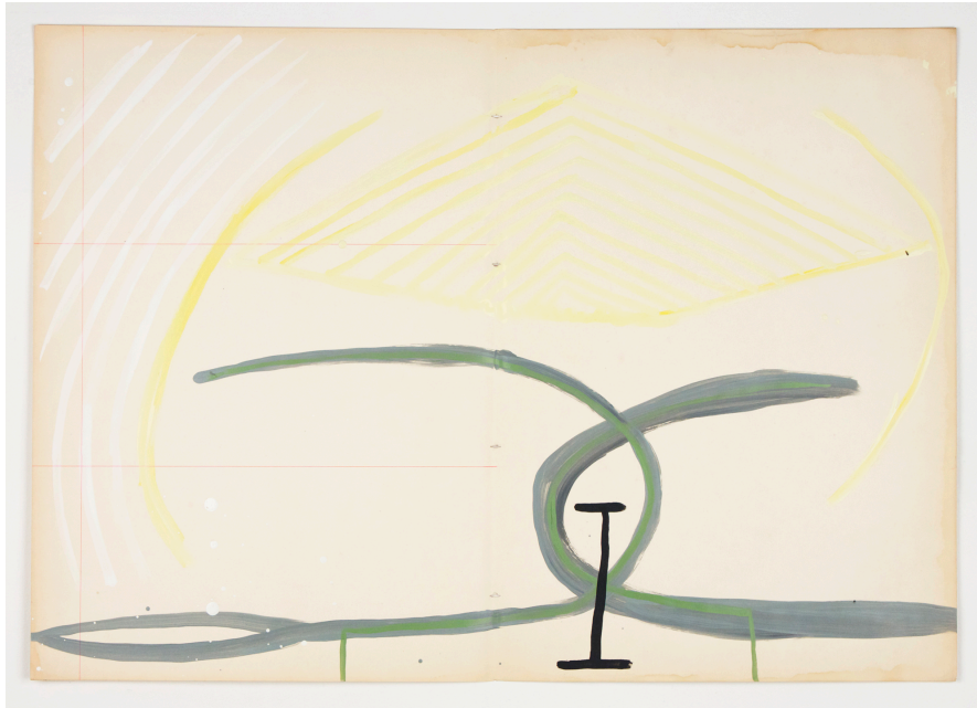
Found Paper #2 , 2014, acrylic and ink on found paper, 20" x 28"