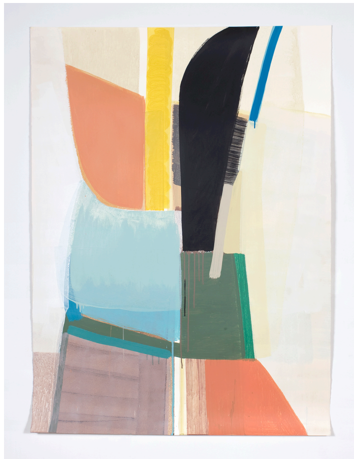
Wedge , 2018, pigment and acrylic on paper, 57.5" x 42"